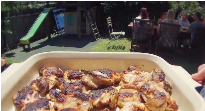
A scene from our 2015 TV Community Announcement

Each campaign, promotion and event needs to be sponsored or it cannot occur and we can't help reduce the significant impact of food poisoning on our community.